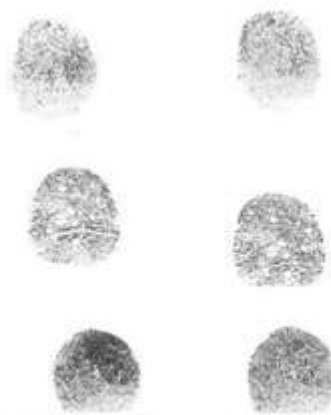
Fig. 4 Samples of Proposed Fingerprint

Resolution, with the FBI NGI standards, easily acquires upper, lower and writer’s palms as well as flat or plain and rolled fingerprints. Using this sensor we captured palmprint images of 20 subjectes in different poses like 10 plain as well as 10 images by rolling palm at various angular position two times. So 40 images are capture from 1 subject. Altogether 800 images are collected from 20 subjects.