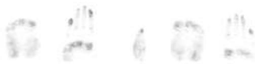
Fig. 5 Samples of proposed Palm Print Database

For collecting samples of palmprint, Crossmatch 500P – RJ6482 sensor is used . Its specifications are: 500 ppi or 1000ppi