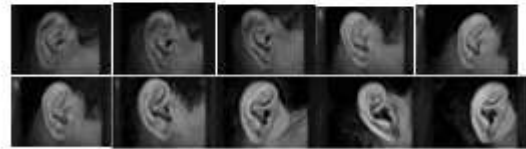
Fig.2 Samples of IIT Delhi Ear Database