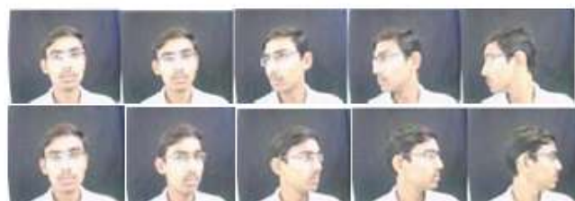
Fig. 6 Samples of proposed Ear Database