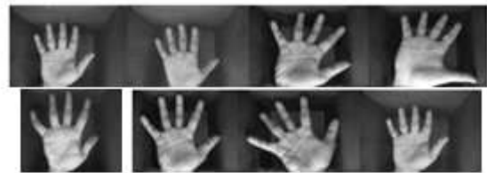
Fig.1 Samples of IIT Delhi Palm print Database

This multimodal dataset was obtained under FP6 EU BioSec Integrated Project. It consists of various fingerprints which were captured through three different types of sensors, front side face images were taken from a web cam, iris images and voice utterances signals are captured from 250 people. The speech patterns were taken down at 44 KHz stereo with 16 bits using devices such as a headset and a distant web cam microphone [6].