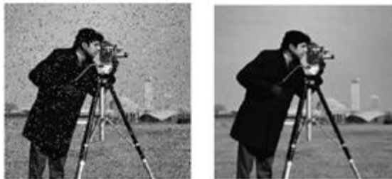
Fig.2. Input and Output of Median Filter

These advantages aid median filters in denoising uniform noise as well from an image. The image processing toolbox in Matlab provides the medfilt2() function to do median filtering on an image. The input image and the size of the window are the parameters the function takes.