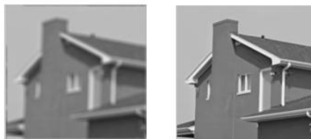
Figure 4: Example for Wiener deconvolution method (a) Blurred image (b) Deblurred image

Our goal in designing the TMM is to make it an objective measure of turbulence mitigation, simple to construct, and easily accessible such that it can be used in any other turbulence mitigation method. One approach to developing a TMM is to utilize the motion estimated from optical flow and global estimations. So the main goal of this approach is to recover the scene and also to get high contrast image then the original image.